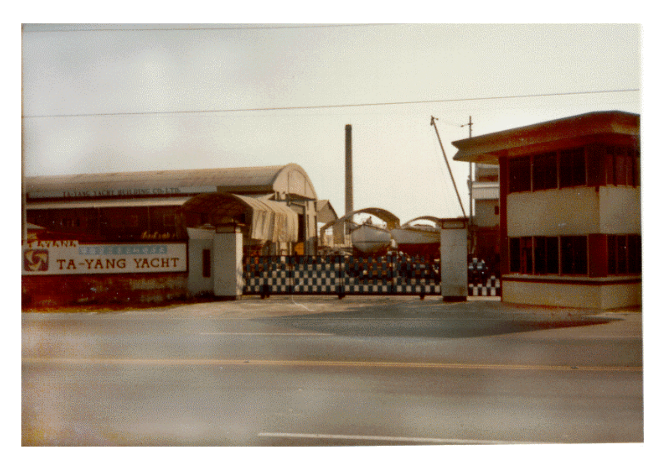
TAYANA'S BIRTH PLACE