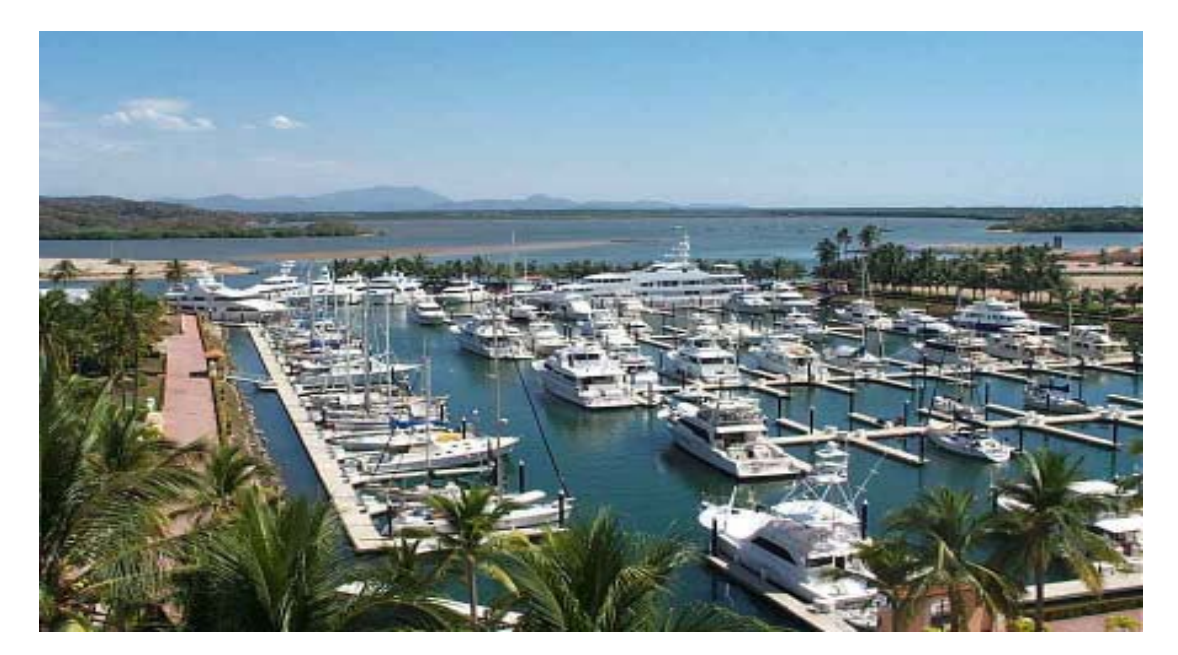
The hotel guest's view of the marina.

The town of Barra de Navidad is an incredibly quaint little town. They were rocked pretty good during the recent earthquake. You can see evidence of it, but luckily, very little serious damage. Across the bay from Barra is Melaque. Each year Melaque has a huge St. Patrick's Day fiesta. We don't know how this got started, but we have been told it rivals parties in the U.S. The anchorage at Melaque is known as "Rocky Melaque". The boats anchored there are subject to the roll and pitch of the water's surge. Thankfully we were not one of them.