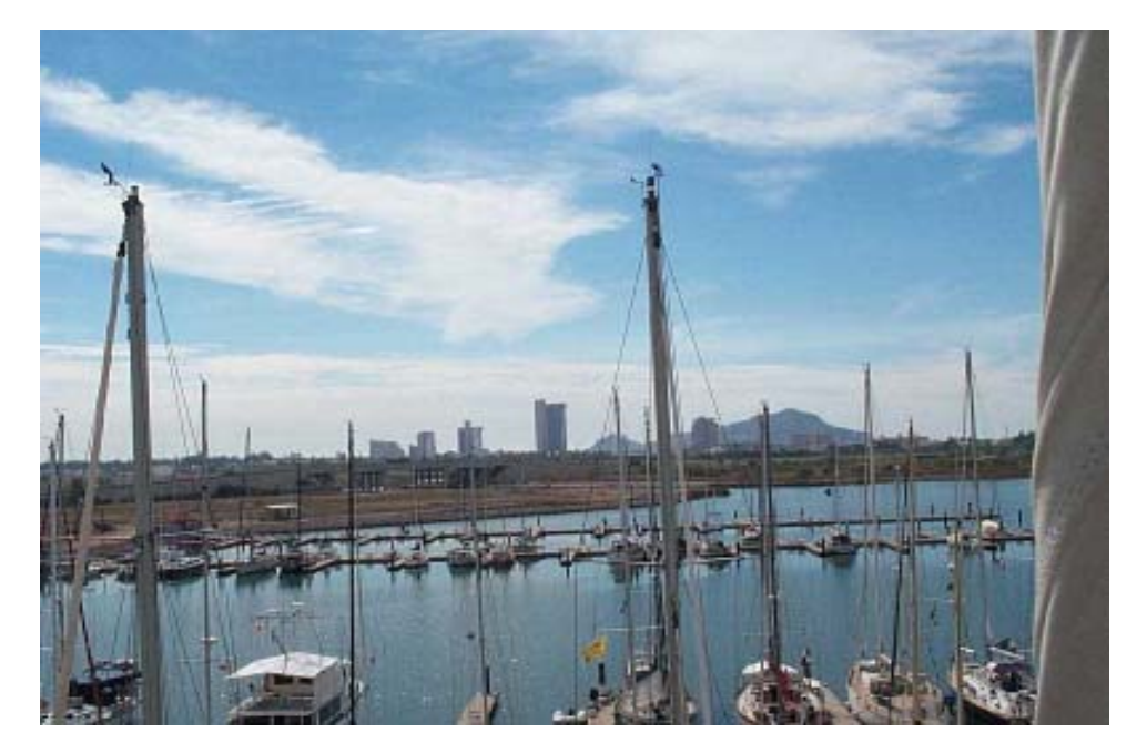
Mazatlan skyline from the top of MR DESTINY's mast.

We have also spent a couple weeks taking Spanish lessons at a local school. Active English has provided two instructors for us and we have been pleased with both of our maestras. The curriculum is excellent and we have learned quite a bit, but more to learn. We know we have a foundation to build upon. We certainly have had opportunity each day to practice our Spanish. The Mexican people appreciate the effort and they help us. One day while riding the bus, we ended up at the end of the line, waiting for the driver to finish his break and resume his return route. While cool-