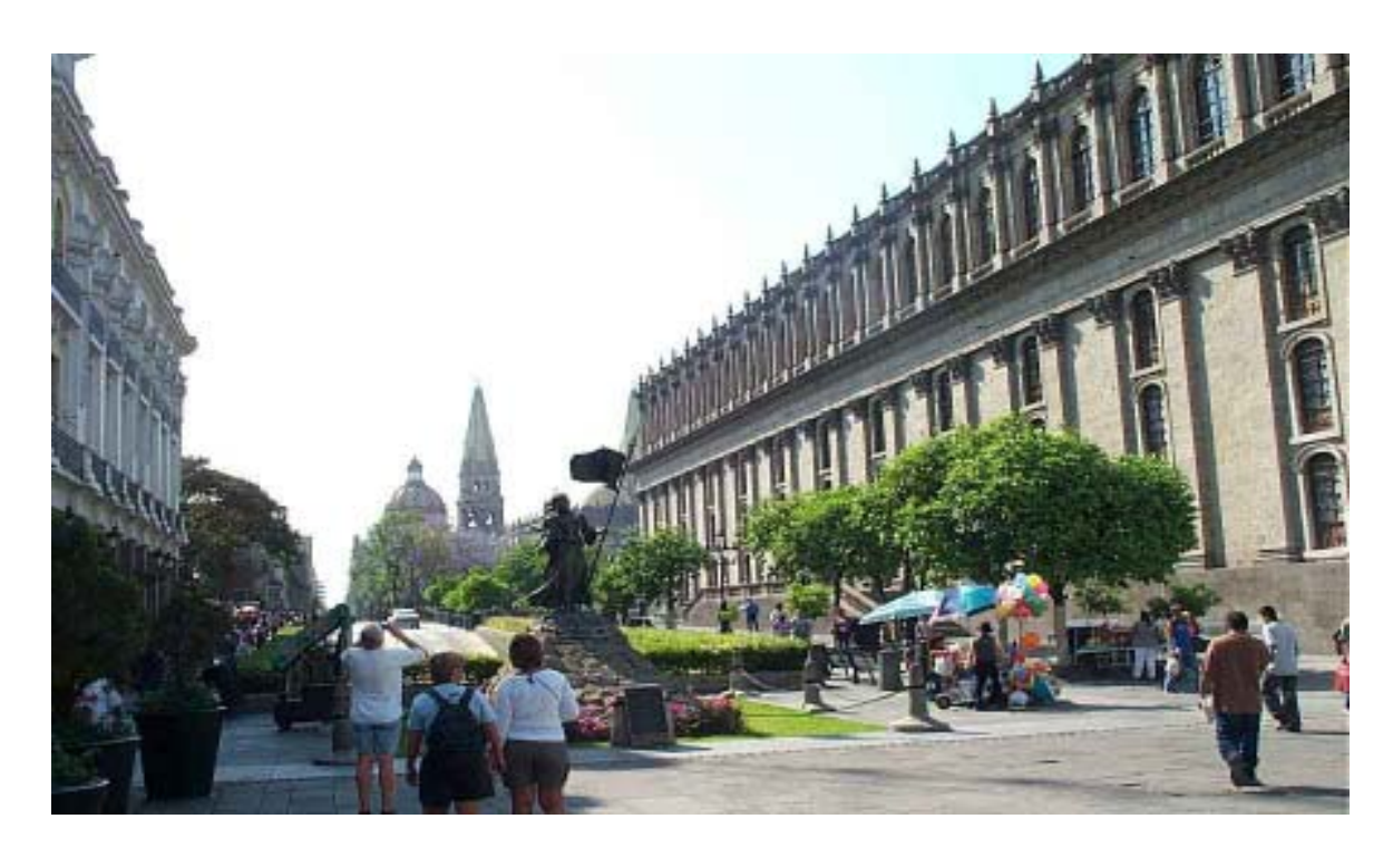
One of the two pedestrian malls in Guadalajara. Great for people watching.

Editor's Note: Watch for the surprising conclusion to M R DESTINY's cruise in the next issue of TOG News . And for more great pictures check out their web site at <www.sailmrdestiny.com>.